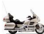
Stream Silver Metallic